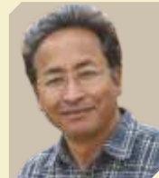
Mr. Sonam Wangchuk Founding-Director SECMOL, Recipient- Ramon Magsaysay Award