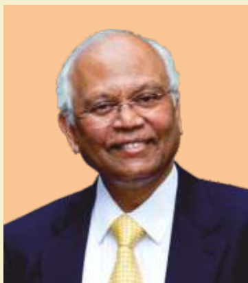
Prof. Dr. Raghunath A. Mashelkar

President-NTC-2019 National Research Professor President, Global Research Alliance