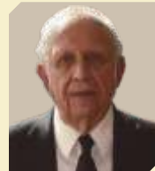
Roy J. Glauber Nobel Laureate Physics Harvard University