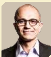
Satya Nadella Chief Executive Officer Microsoft