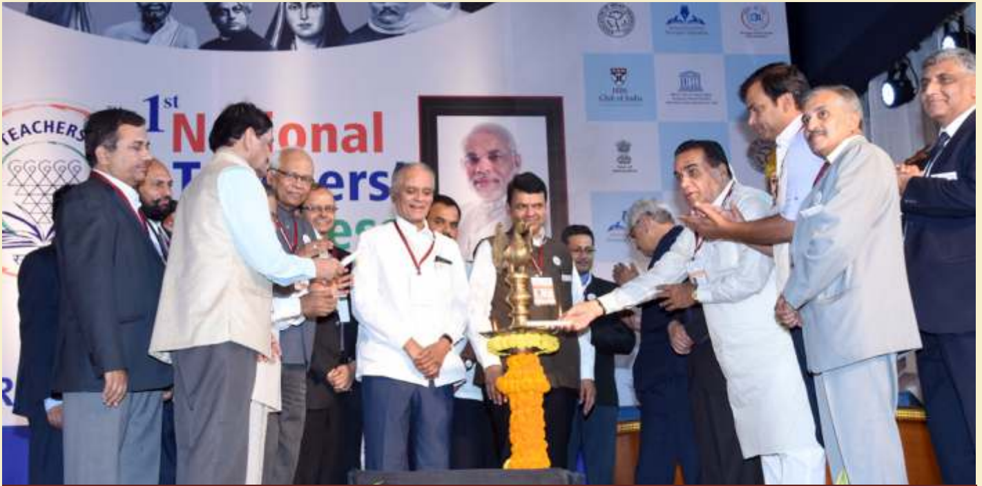
Lighting of the Lamp by Key Dignitaries