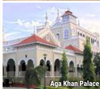
Aga Khan Palace