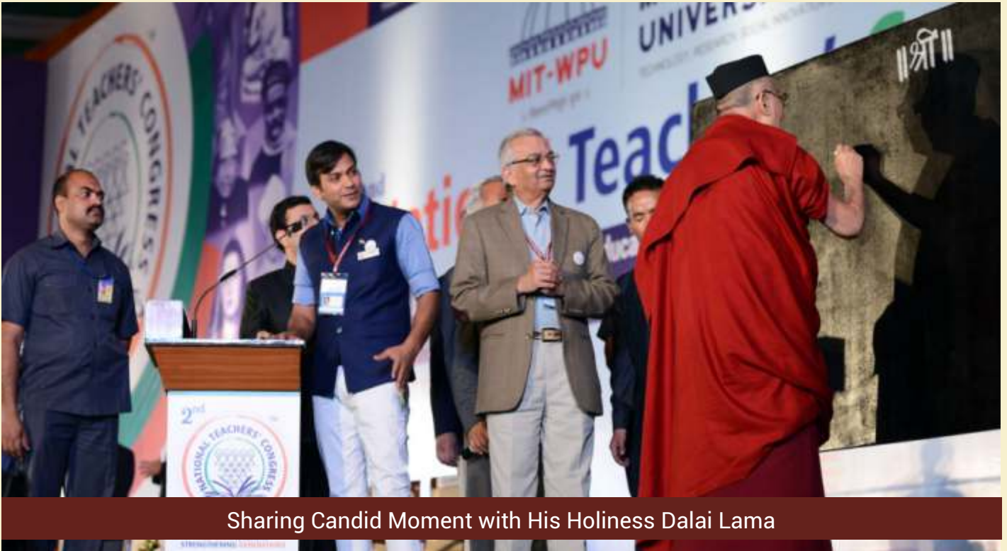
Sharing Candid Moment with His Holiness Dalai Lama