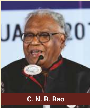
C. N. R. Rao