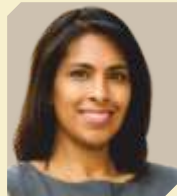
Sangeeta Bhatia Director- Laboratory for Multiscale Regenerative Technologies- MIT