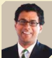
Atul Gawande Prof. - Surgery, Harvard Medical School