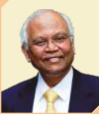
R. A. Mashelkar

National Research Professor President, Global Research Alliance