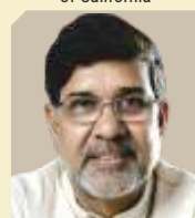
Kailash Satyarthi Nobel Laureate and Founder Save the Child Movement