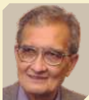
Amartya Sen Indian Economist & Philosopher Recipient of Nobel Prize